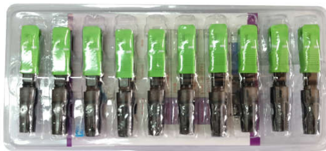
the packing of the product (10pcs/box, with user manual)