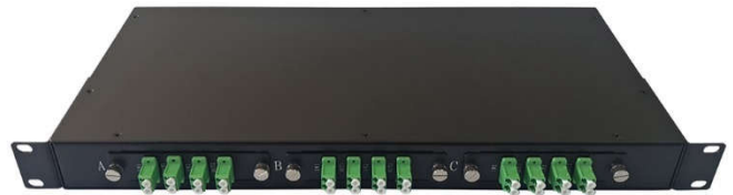
with Adapter Type Modules