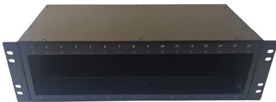
3U Empty Chassis (Front)