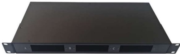
1U Empty Chassis

PLC splitters module patch panel have been designed to simplify installation and offer users an easy to expand modular system. Our offers two type of splitter module rack mount patch panel: 1U 19" patch panel and high density 3U 19" patch panel. 3U patch panel offers much in expandability. PLC splitter module and blank panel are ordered separately. Flexible and scalable platforms, customized design available upon request.