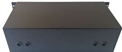
3U Empty Chassis (Back)