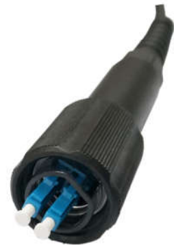
PDLC Connector (SM-LC-PC)