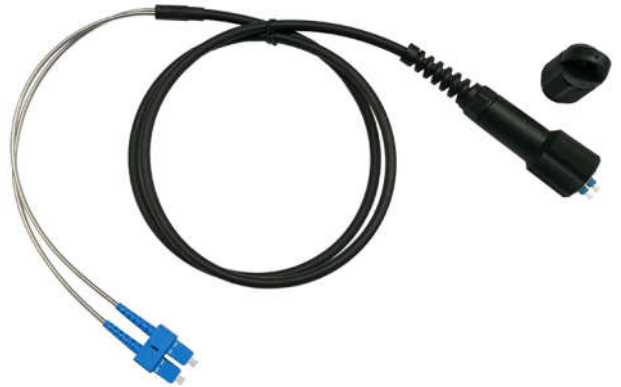
PDLC Patch Cord (with armored tube)

PDLC FTTA outdoor waterproof armoured patch cord assembly is standard size for duplex LC connectors, and the outer housing with protective device. The connecting is safe and reliable. This patch cords widely used in FTTA, base station, and the outdoor waterproof condition.