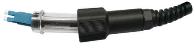
PDLC Connector Structure