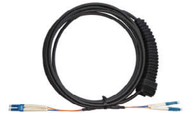
NSN Duplex LC Arbitrary Bending Connector Φ5.0mm Patch Cord

NSN FTTA duplex branch patch cord for the new generation wireless base stations pulled far tailored products that can be meet the FTTA (fiber to the top of the tower) program requirements for outdoor environment conditions and adverse weather conditions.