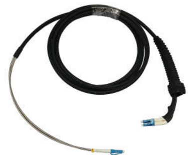
NSN Duplex LC 90° Connector Φ7.0mm Armoured Patch Cord