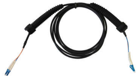
NSN Duplex LC Arbitrary Bending Connector Duplex Boot Φ5.0/ Φ7.0mm Patch Cord