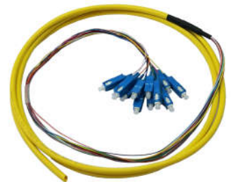
pigtail (only one end connected)

Bundle cable has the advantage of giving less congestion than 12 individual buffered fibers with outer jacket and aramid yarn, can save space for cable ducts. It is generally installed in closet area like rack mount or wall mount splice boxes or patch panels. Patch cords /pigtails are a custom design product; cable length, jacket types and connectors are with many options.