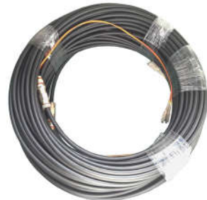
Patch Cord (connected with two ends)