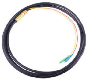
Pigtail (only one end connected)